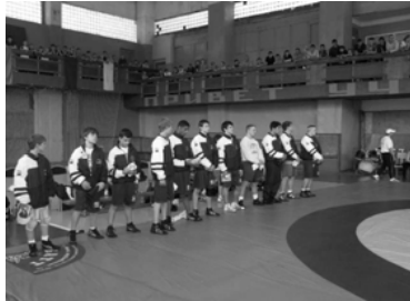
Team USA prepares for a dual meet against the Belarus National Team

Train this summer in Minsk, Belarus! This 14-day intensive wrestling opportunity will give you the chance to train with the Belarus National Team. The team will stay and train at the Belarus Olympic Village. Wrestlers will have the opportunity to meet other Belarussian athletes in residence. Don't miss your chance. This tour is packed with many cultural highlights, tough competition, and outstanding coaching.